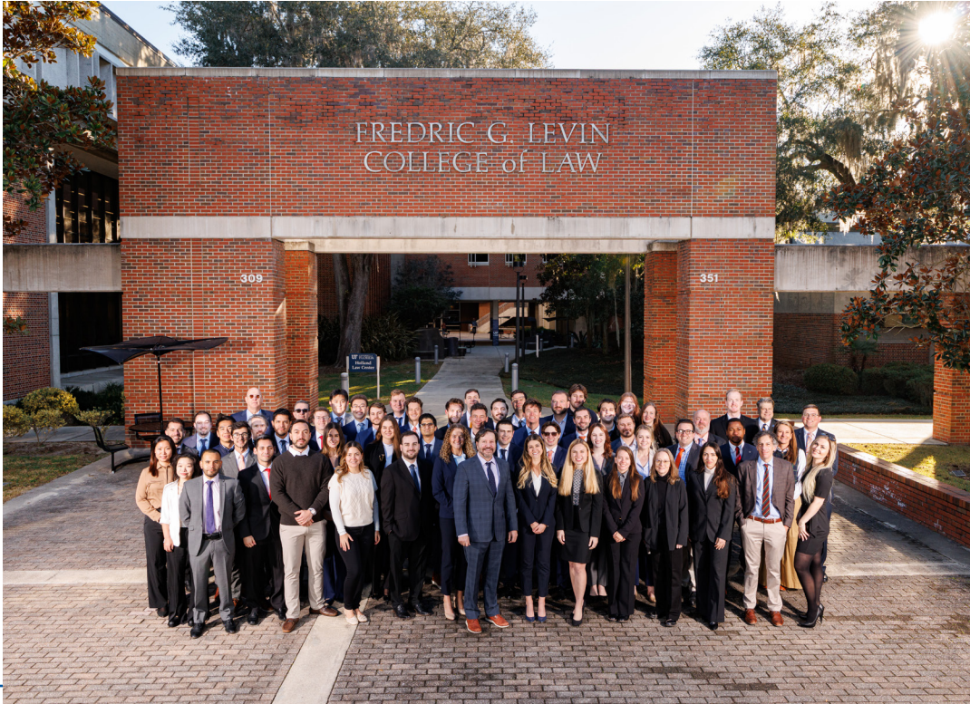
Master of Laws in Taxation